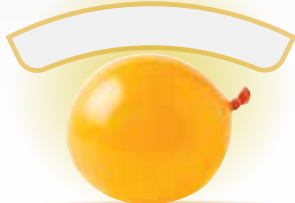
SmartCurve: Curved for Improved Comfort

The curved design of SmartCurve distributes pressure more evenly over the breast to reduce pinching. It has been shown to improve comfort in 93% of patients who reported moderate to severe discomfort with standard compression methods.